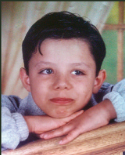
A photograph of Ethan A. (pseudonym) held by his mother, showing her son at age 11, four months before he was arrested for committing a sex offense and placed on the sex offender registry in Texas.

Human Rights Watch calls on states and the federal government to exempt youth sex offenders from registration in combination with community notification. Short of a full exemption, states should remove all youth sex offenders from registration schemes that are not specifically tailored to take account of the nature of their offense, the risk they pose (if any) to public safety, their particular developmental and cognitive characteristics, their needs for treatment, and their potential for rehabilitation.